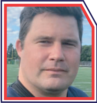
Varsity Assistant Coach

Most Memorable Wrestling Season – Why? Orono Wrestling 2001-2002 we went from being winless in dual meet competition to above .500 record. It's the biggest turnaround in Orono Wrestling History. It means a lot to be a part of that team and have those great memories with my teammates.